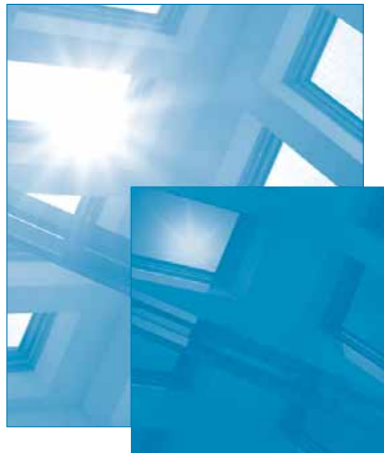
Example of an electrochromic glass system (switchable glazing product)